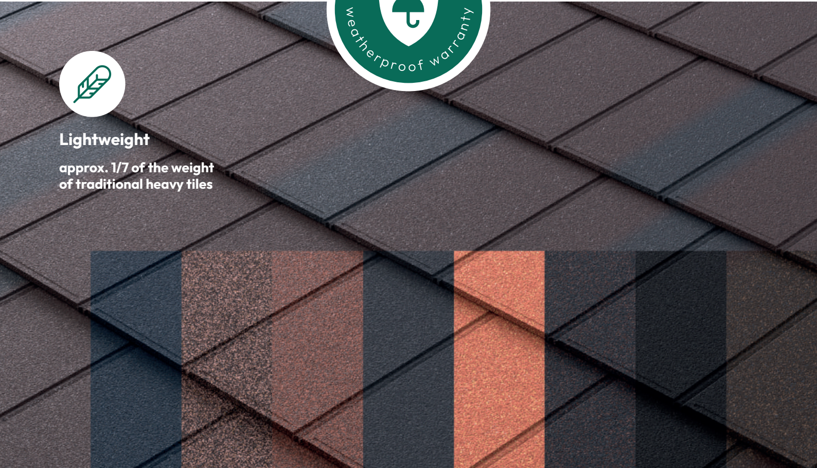
Shingle Brown Black

approx. 1/7 of the weight of traditional heavy tiles